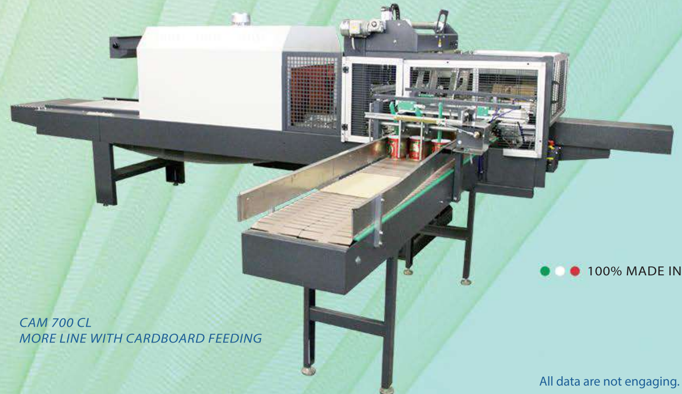
CAM 700 CL MORE LINE WITH CARDBOARD FEEDING