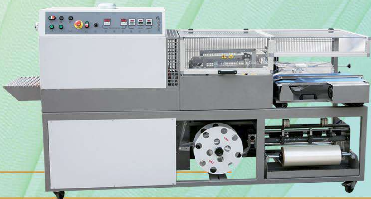
DYNAMIC 5038 MB