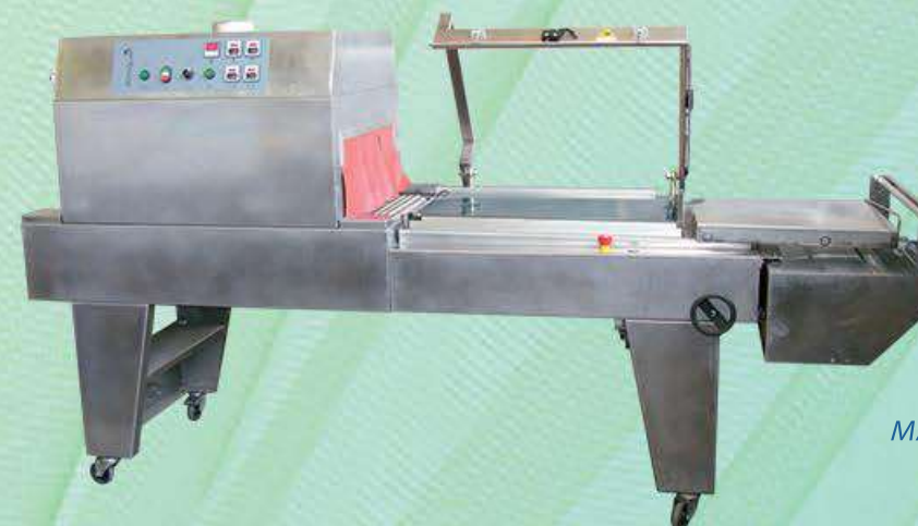
MATRIX 7550 INOX